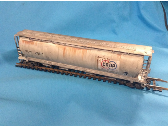
Figure 6 Paul Lessard modified this Bachman 100 ton covered hopper with new couplers and trucks; metal wheels and cut levers.