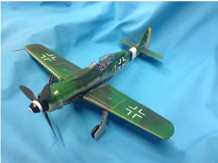
Figure 8 David Kamerman built this 1/48 Fw 190 D9 from DML