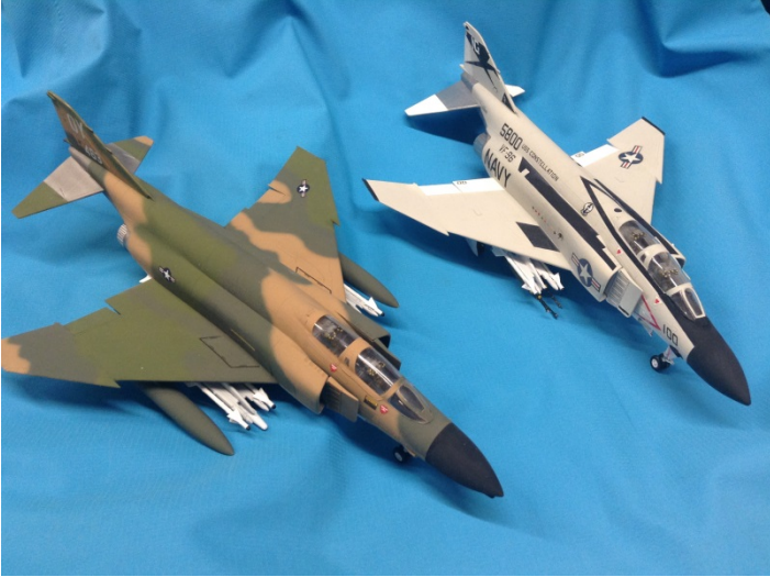
Figure 4 John Walker flew into the club meeting with these 1/72 Monogram Phantoms.